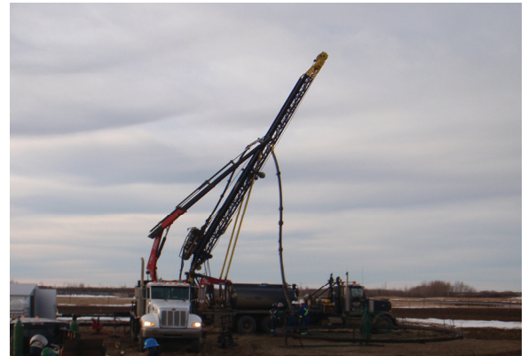
“Slant Flushby, Truck Mounted Gripper, Endless Rod Welder”